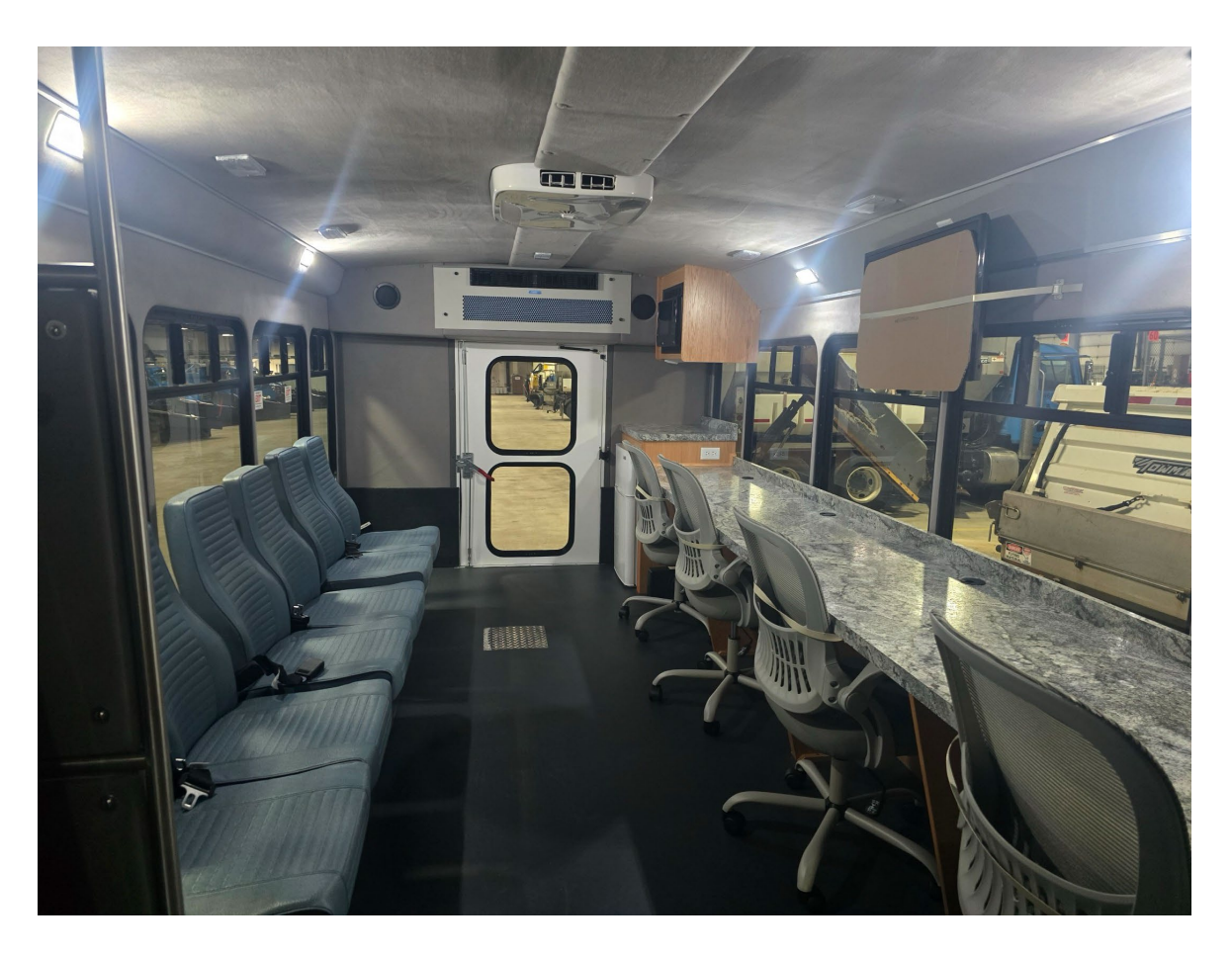
The outreach vehicle is expected to be fully completed by early February!